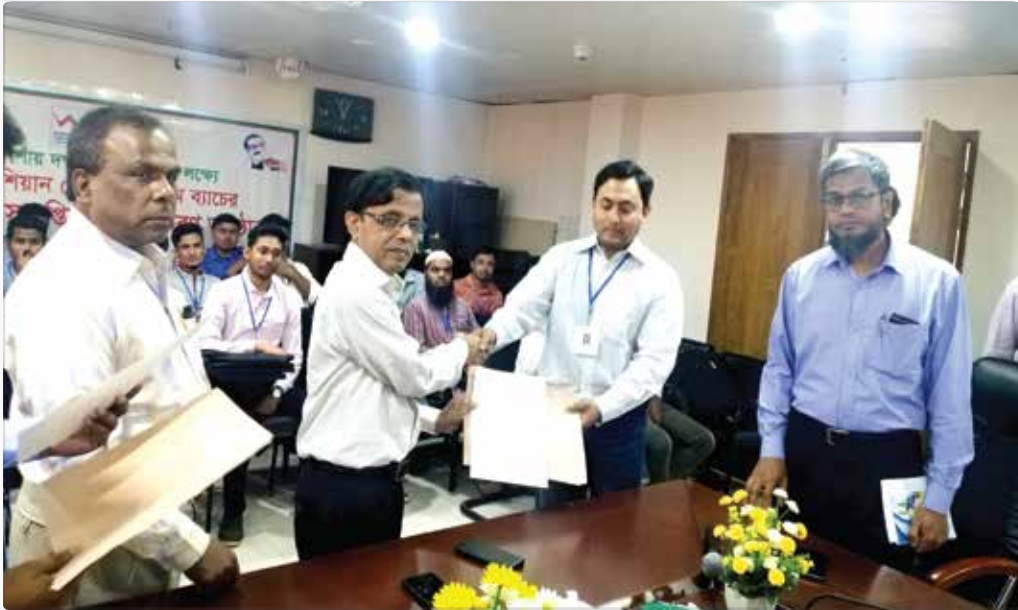
NWPGCL gave away certificates to the trainee of 1 st Batch after successful completion of 'Electrician Training Course' at Khulna 225 MW Combined Cycle Power Plant