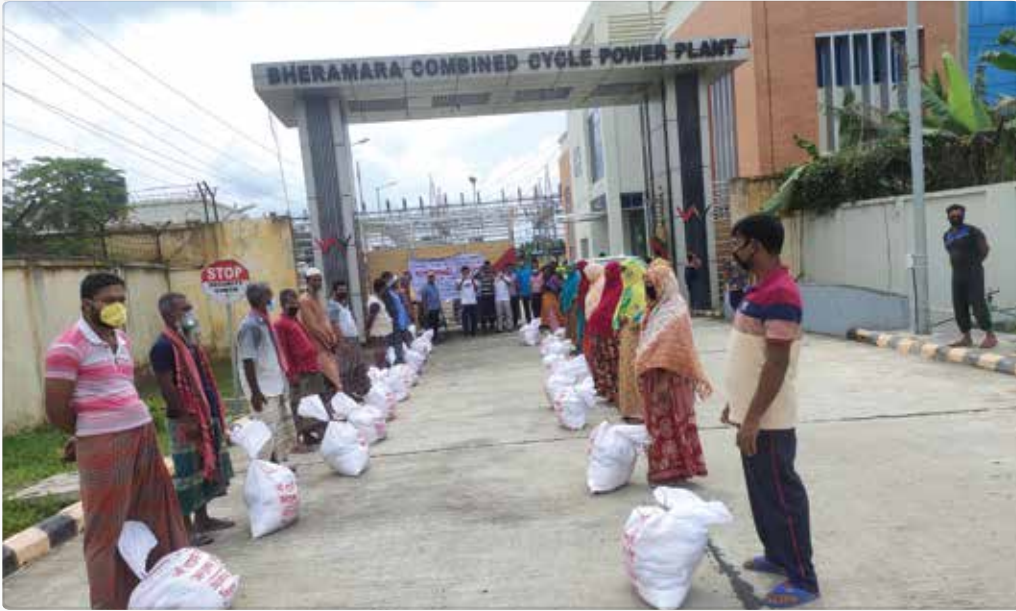
NWPGCL gave food assistance to the affected people around Bheramara 410 MW Combined Cycle Power Plant due to Covid-19 Pandemic