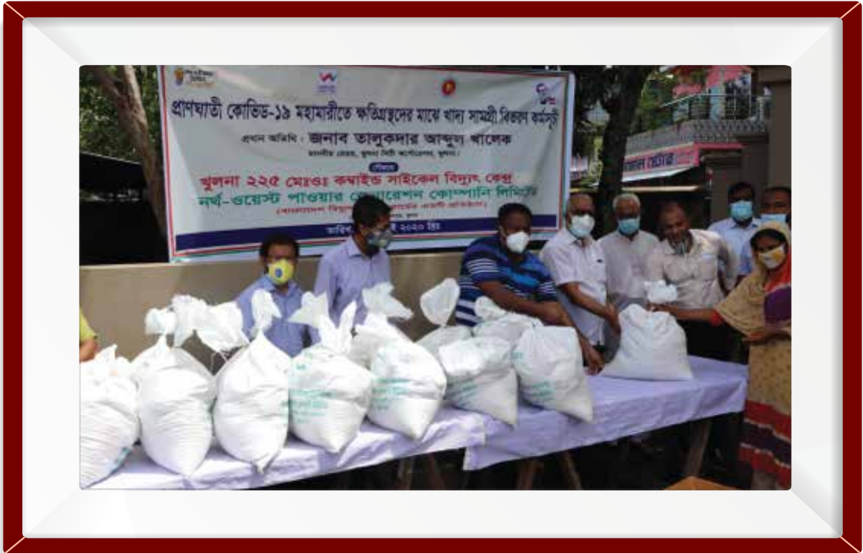
NWPGCL gave food assistance to the affected people around Khulna 225 MW Combined Cycle Power Plant due to Covid-19 Pandemic