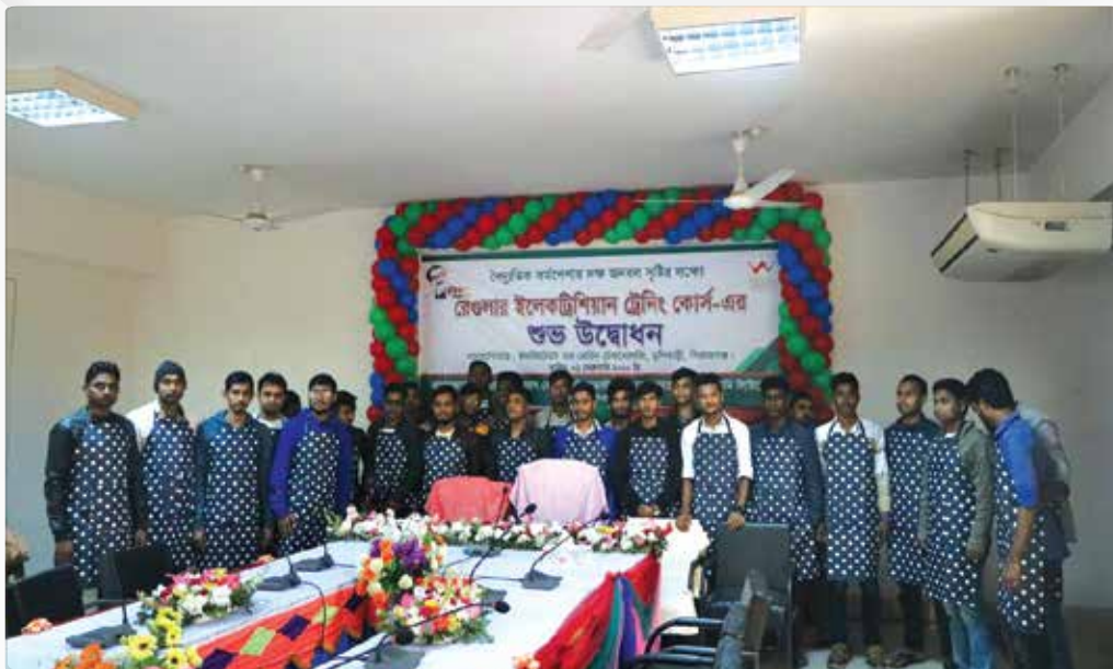
Inauguration of "Regular Electrician Training Course" at Sirajganj Power Plant