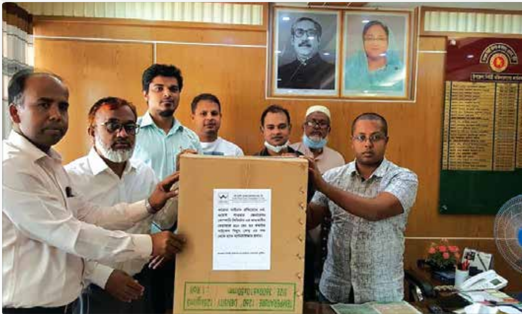
NWPGCL gave hand sanitizer to the UNO, Bheramara due to Covid-19 Pandemic