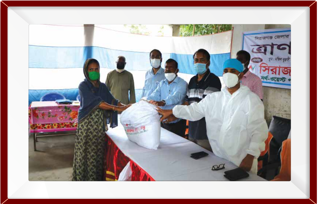
NWPGCL gave food assistance to the affected people around Sirajganj Power Plant due to Covid-19 Pandemic