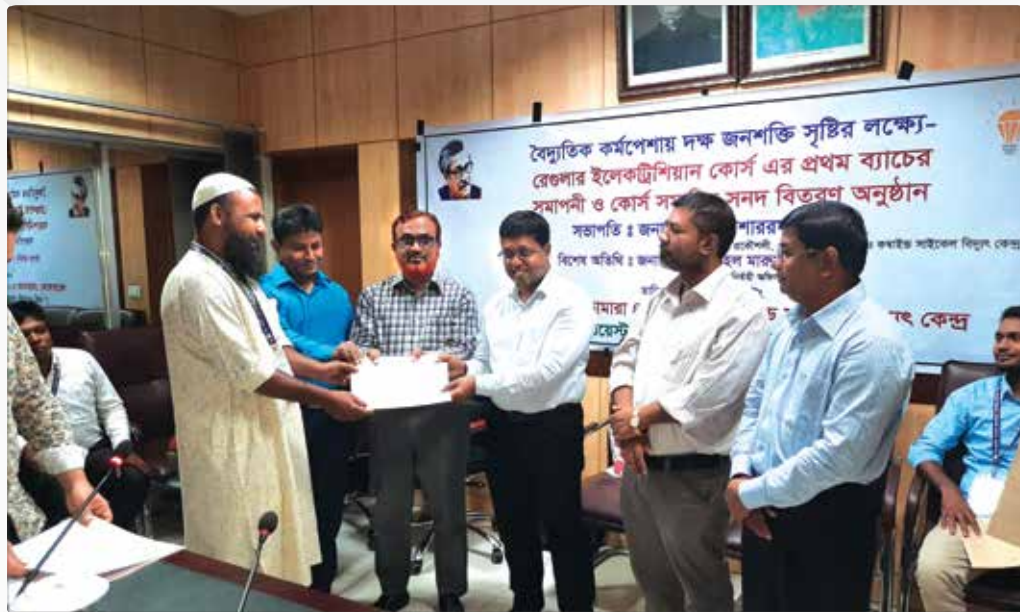
NWPGCL gave away certificates to the trainee of 1 st Batch after successful completion of 'Electrician Training Course' at Bheramara 410 MW Combined Cycle Power Plant