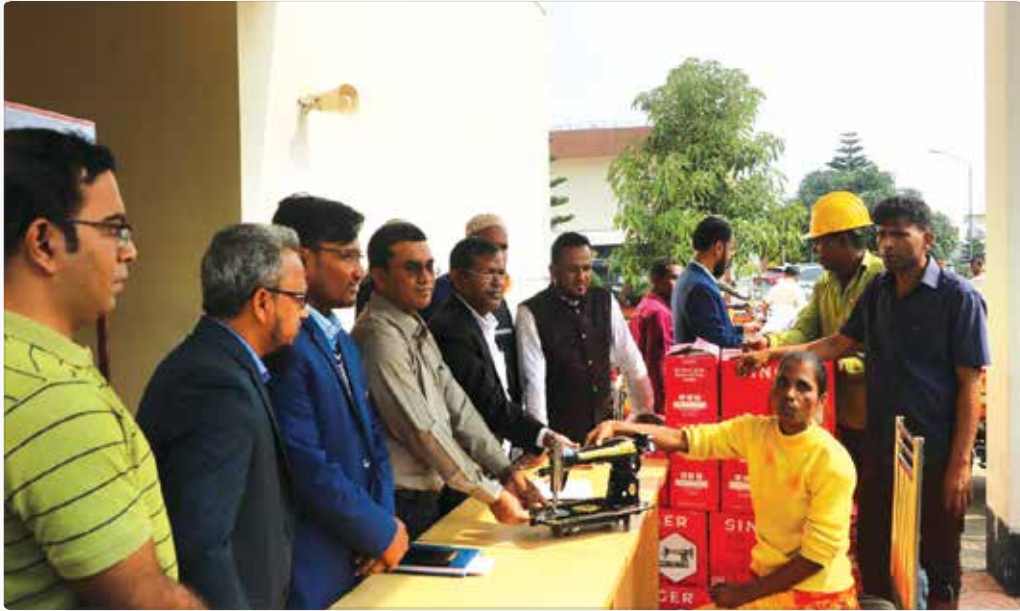
NWPGCL distributed sewing machine to poor and physically challenged women around Sirajganj Power Plant