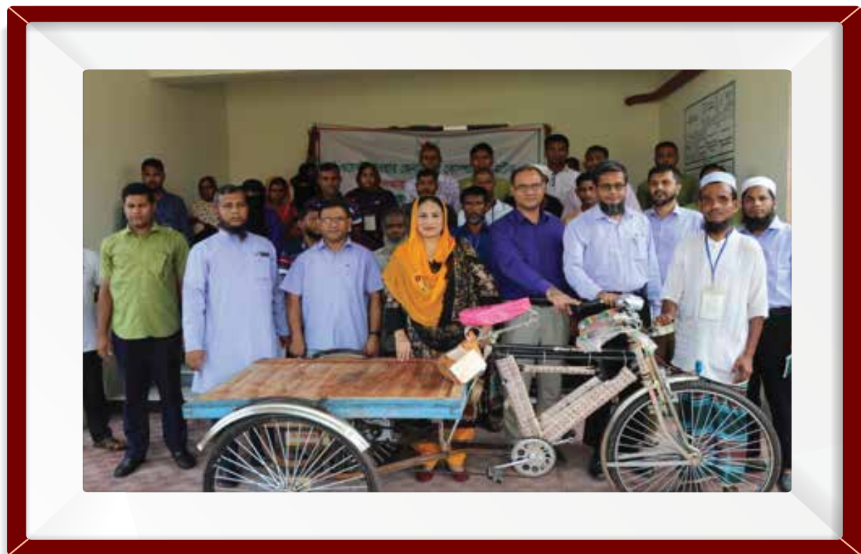
NWPGCL distributed Rickshaw Van to the Poor men around Khulna 225 MW Combined Cycle Power Plant

Under the present pandemic out-break of COVID-19, NWPGCL shows a crucial role by standing beside the government to fight against COVID-19. As well as company supports the poor and jobless people for surviving in COVID-19 Situation. NWPGCL has contributed 02 (two) crores BDT to the ``Honorable Prime Minister's Relief and Welfare Fund'' for preventing Corona Virus (COVID-19). The Company also donated COVID-19 testing kits to IEDCR, a good numbers of High Flow Nasal Cannula to the Govt. Hospitals from its CSR fund. At the time of general vacation (Lockdown) for preventing COVID-19, NWPGCL stands beside the poor and jobless people. During this pandemic HR department has influential role in raising COVID-19 awareness programs. HR department has implemented guidelines for service rendered during the pandemic time. As per direction of govt. and CEO of NWPGCL it has provided masks, sanitizers to all employees. Moreover, Germs removing tunnel has also placed at all offices of the Company.